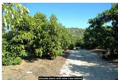
avocado plants with olive trees behind