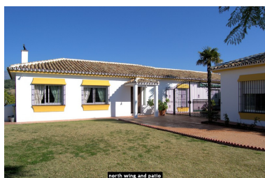
north wing and patio