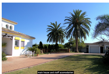
main house and staff accommodation