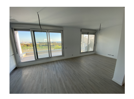
Price: 335,000 € Printing day : 23rd July 2025

M<sup>2</sup>: 74 Parking places: by request