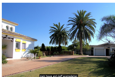
main house and staff acomodation