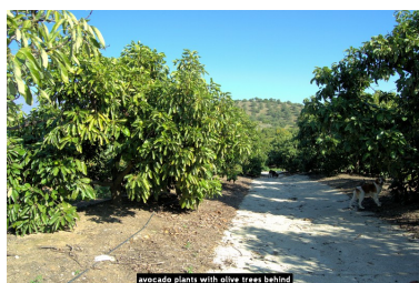
avocado plants with olive trees behind