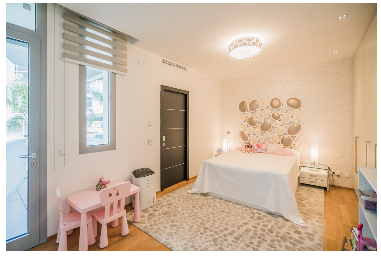
Спальни: 2 Статус: Продажа